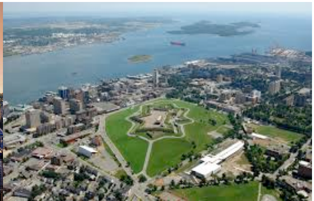
Beautiful Lunenburg at sunset; Citadel Hill, Halifax