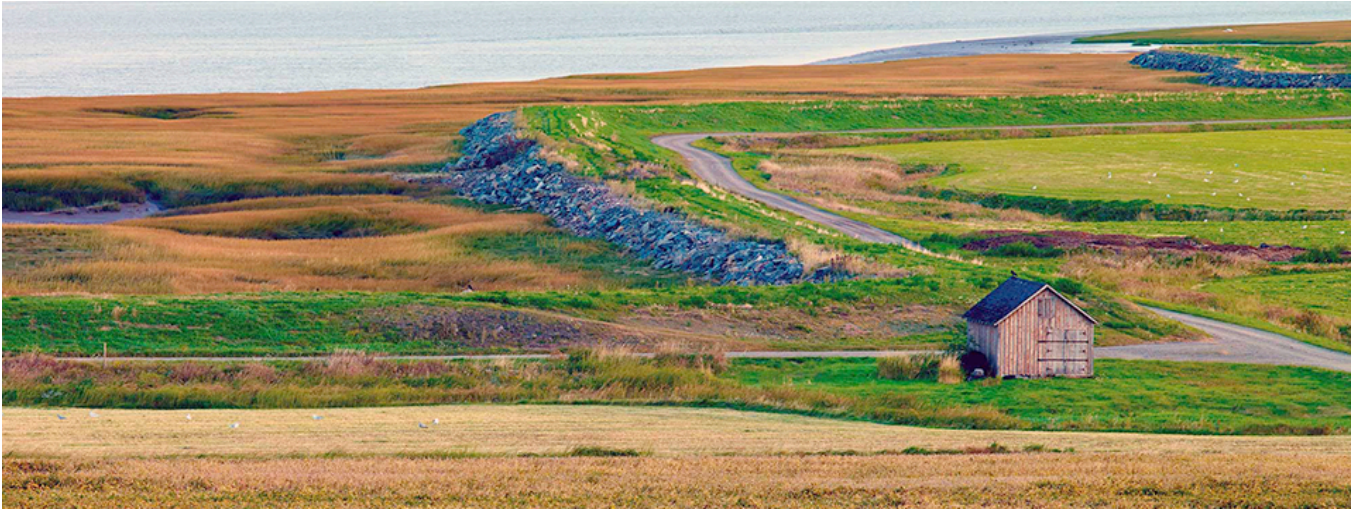
The magnificent view at Lightfoot & Wolfville, courtesy Wines of Nova Scotia